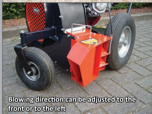
Blowing direction can be adjusted to the front or to the left