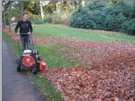
Fanhouse is mounted slightly in offset for efficient working