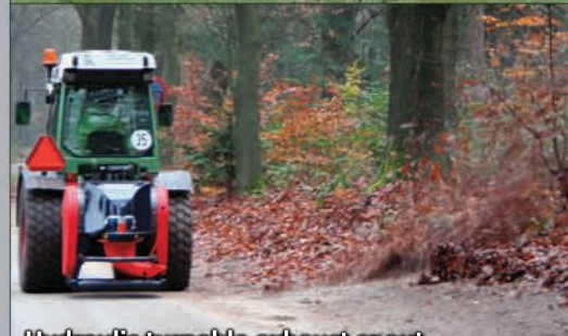
Hydraulic turnable exhaust spout