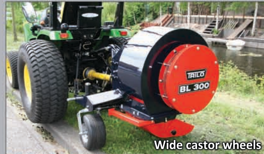
Wide castor wheels