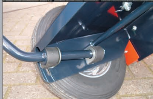
Handles are mounted in shock absorbers