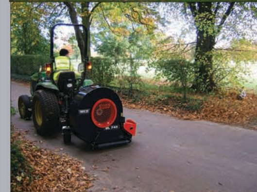
Reversible exhaust spout